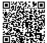
Interactive Trail Map

Telephone: (602) 506-2930 #4 E-mail: MaricopaCountyParks@maricopa.gov Website: https://www.maricopacountyparks.net/