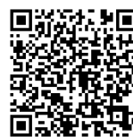
Interactive Trail Map