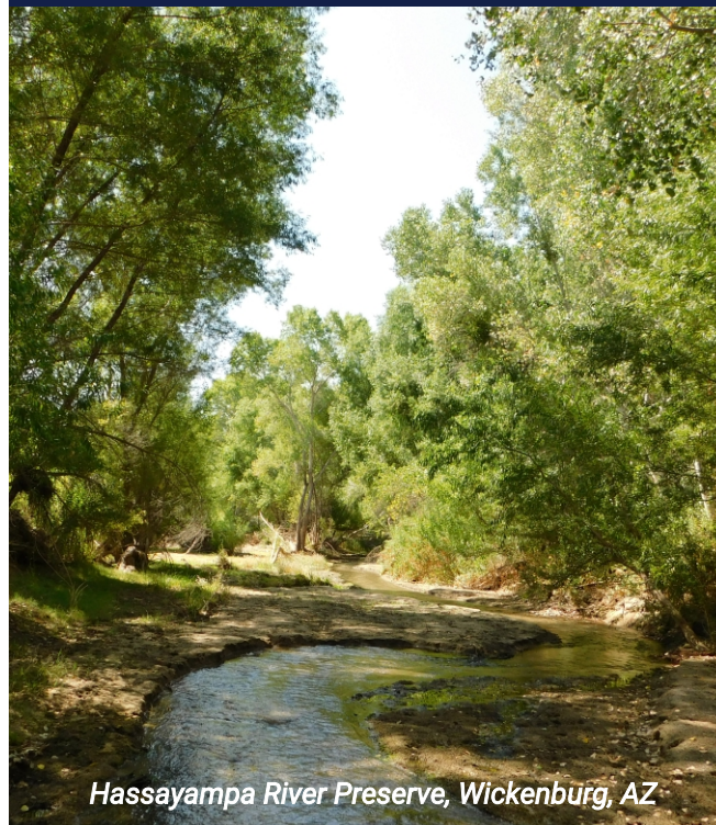
Hassayampa River Preserve, Wickenburg, AZ