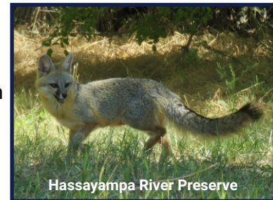
Hassayampa River Preserve

Maricopa County's regional parks offer ample opportunities to explore nature. Visit one of our many nature centers; experience a guided hike or program with one of our talented Interpretive Rangers; watch the abundance of wildlife throughout our parks. The recreation possibilities are endless with over 280 miles of park trails for hiking, biking, and horseback riding. Designating these scenic trails for non-motorized use only allows the public to be safe and enjoy the primitive desert. The Maricopa Trail is a regional trail system that connects all of Maricopa County's regional parks with over 300 miles of trails circling the metropolitan area.