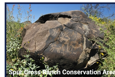
Spur Cross Ranch Conservation Area

Through agreements with privately-owned companies, Maricopa County Parks offer multiple forms of recreational activities such as horseback riding, a water park and golfing.