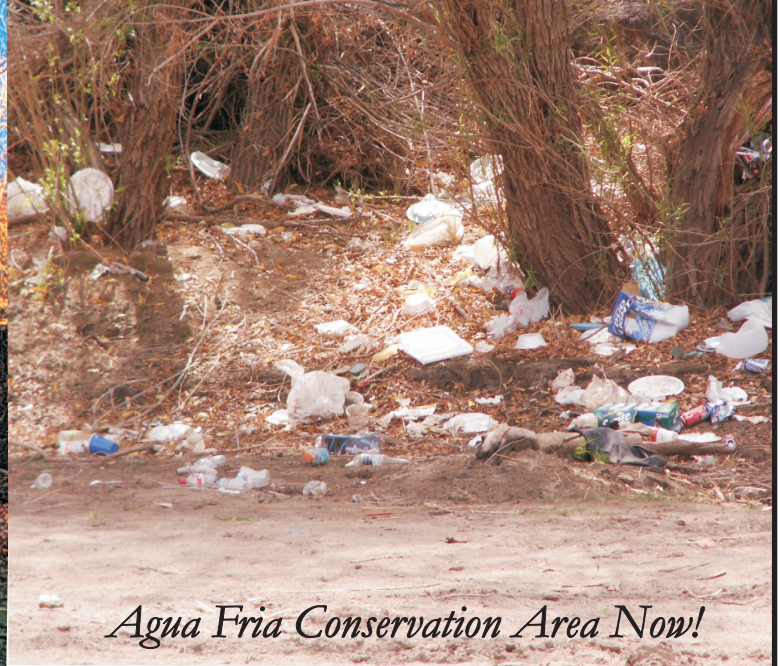
Agua Fria Conservation Area Now!

Maricopa County's Parks and Recreation Department, the Bureau of Reclamation and multiple partnering agencies are very concerned about the illegal dumping, shooting and off-highway vehicle use at the Lake Pleasant Regional Park Agua Fria Conservation Area which is located south of Table Mesa Road. During a recent clean-up, 32 tons of trash were removed from the area and the dumping continues to be a problem. Illegal shooting is occurring creating an unsafe environment. Irresponsible off-highway vehicles are causing damage to the desert and riparian areas in and near the park.