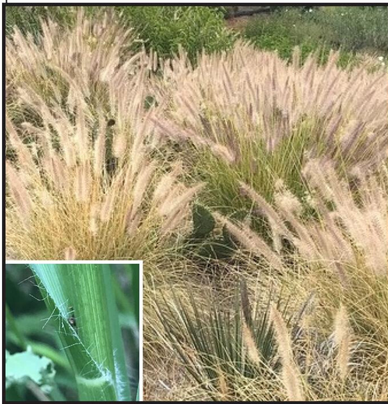
Fountain Grass ( Pennisetum setaceum ) - Purplish upright stems with long inflorescence.