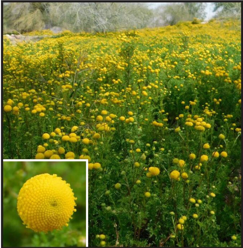
Stinknet ( Oncosiphon piluliferum ) - Plant is two to three feet tall with round globe flowers and spreading quickly.

These invasive species are outcompeting native desert species, which local wildlife depend on for food, shelter and habitat. Many of these invasive species form dense monocultures, altering the desert landscape and creating a hazardous fire risk. These species could be spreading in your area; early detection and eradication can prevent an invasion. Mapping these invaders is the first step to managing them, and preventing further spread.