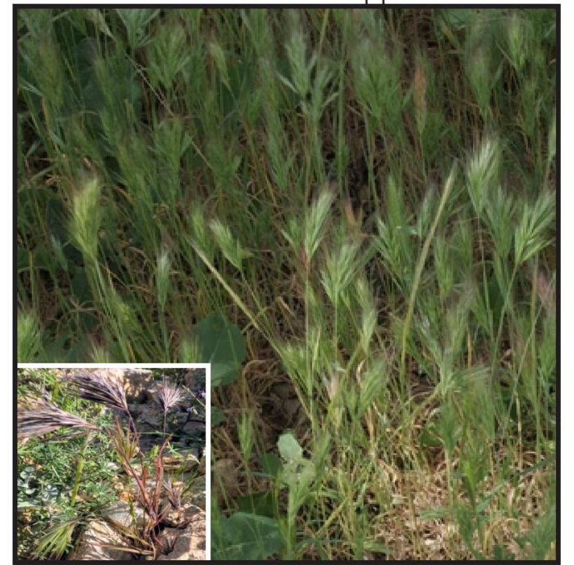
Red Brome Foxtail ( Bromus rubens ) - Dense panicle with purplish tinge.