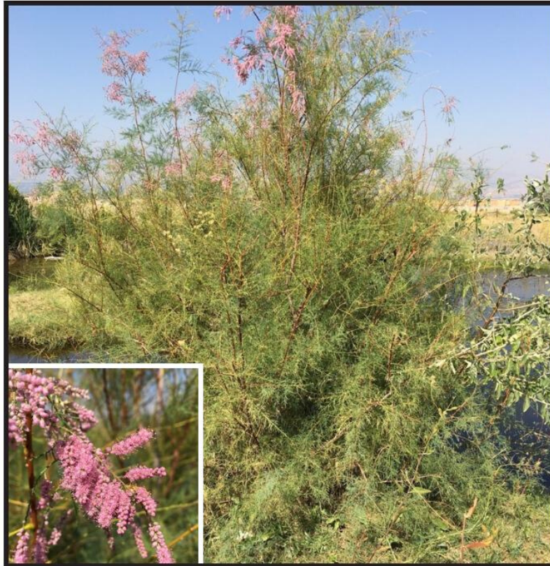
Salt Cedar ( Tamarix spp. ) - 20 to 25 feet tall, feathery appearance, small bright pink flowers.