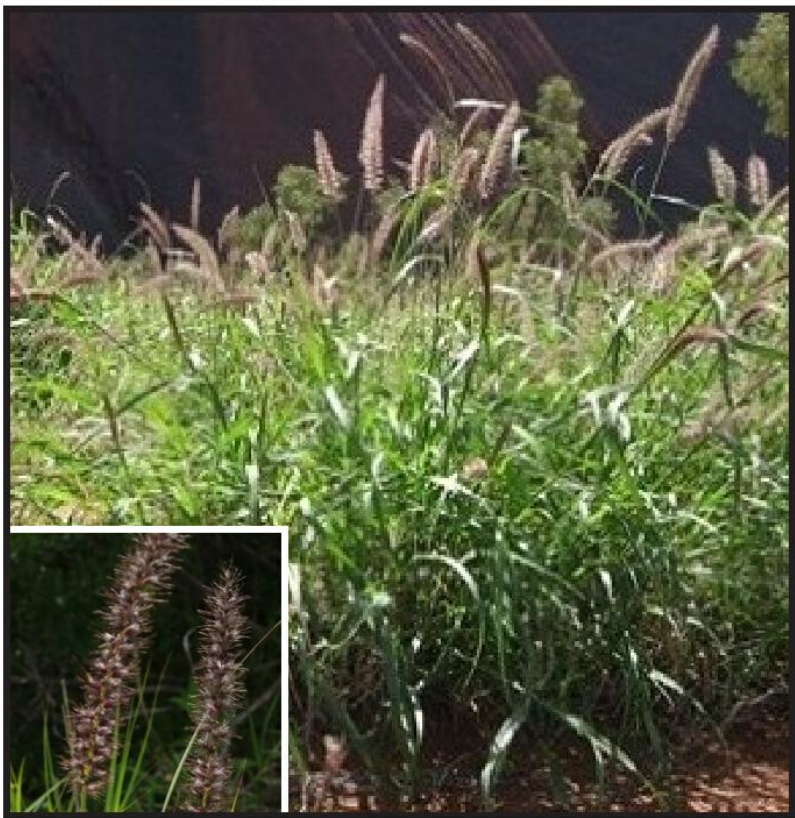
Buffelgrass ( Pennisetum ciliare ) - Bunched grass with round reddish stems.