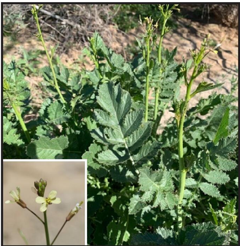
Sahara Mustard ( Brassica tournefortii ) - Butterfly shaped flowers.

Help save the Desert Habitat! To get involved in mapping these plants, please contact CAZCA at email cazca@dbg.org or call 480-481-8187. Or contact Maricopa County Parks Volunteer Coordinator at email parkvolunteer@mail.maricopa.gov or call 602 506-9510.