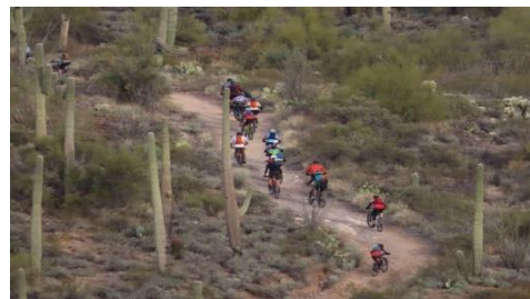
Prickly Pedal Event Photos