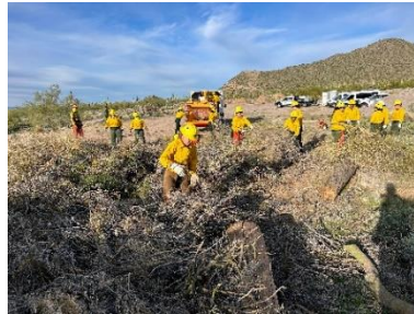
AZ DFFM Fire Fuel reduction project