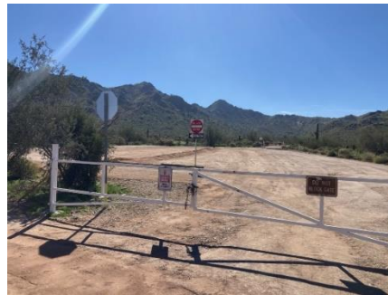
San Tan Goldmine