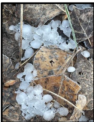
Hassayampa - The Preserve saw approximately 1/2" of much-needed rain, followed by a spectacular hailstorm.