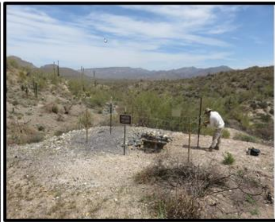
Mine Security after photo