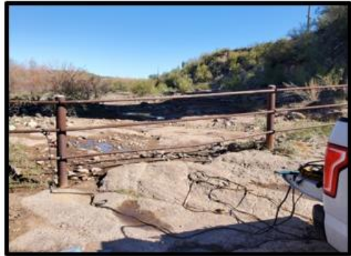
Lake Pleasant - Repaired broken boundary fence boundary. (Morgan City Wash)