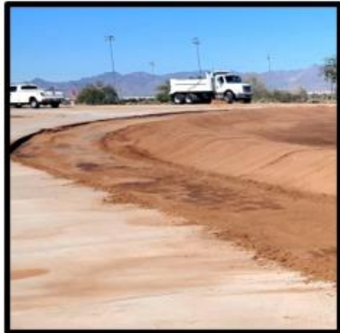
Estrella - Began Phase 1 turf reduction project. (Graded area, constructed berm, and collected boulders)