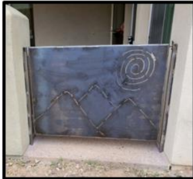
Cave Creek- Nature Center Gates(2)