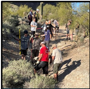
San Tan – Park maintenance teamed up with 18 San Tan Shredders' bike group members to perform four miles of trail work on the Malpais Trail.