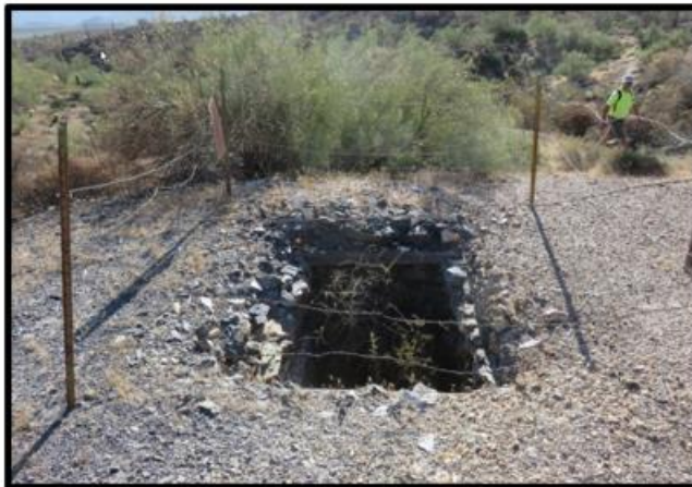
Cave Creek- Mine repairs before photo