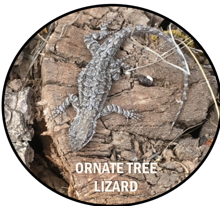
ORNATE TREE LIZARD

Ornate Tree- is a small, slim lizard (body length 1.5-2.25") commonly found in cottonwood or mesquite trees along with riparian areas. Its markings blend well with the bark to help it avoid predators. Gray-brown or tan body with ornate thin, dark lines on top of the head. Body markings are variable but consist of black-dark brown irregular-shaped blotches. Their back has two lengthwise strips of enlarged keeled scales. Diet: Insects and spiders